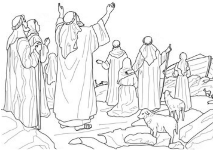
God's rainbow covenant with Noah – Genesis 9