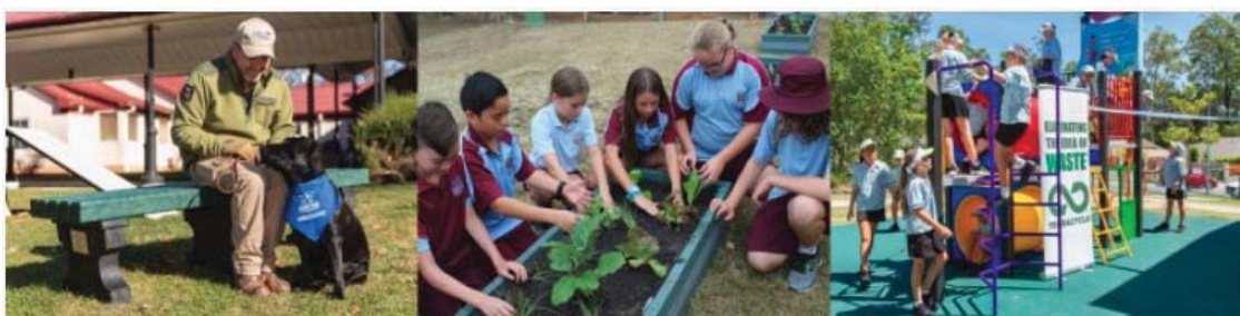
Benches, playgrounds, and garden beds are some of the many end-products that can be manufactured using the recycled materials collected through our programmes.