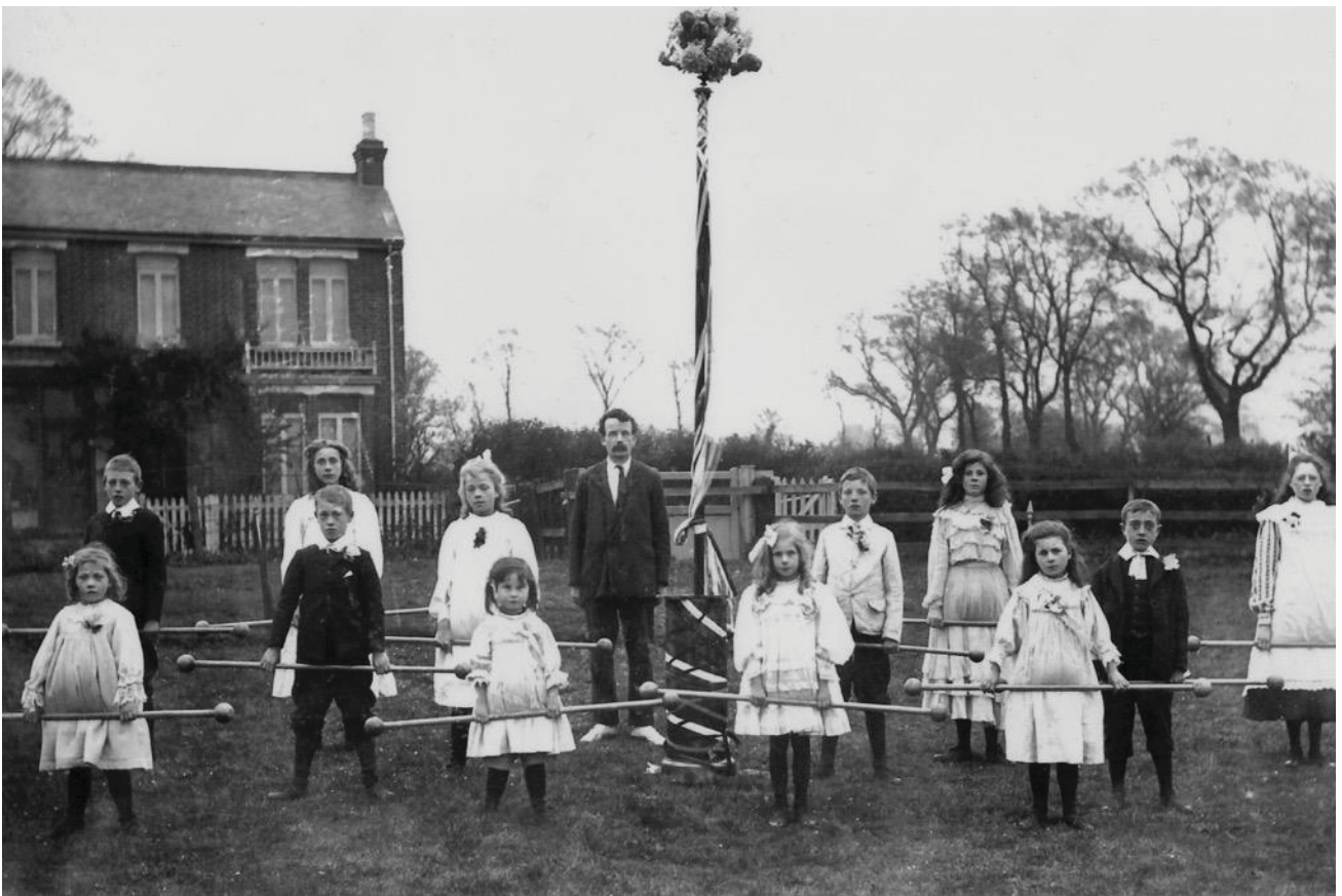
Mayday celebrations at the maypole in Brentwood Road - date unknown

Each month we will publish a few photographs from this extensive collection