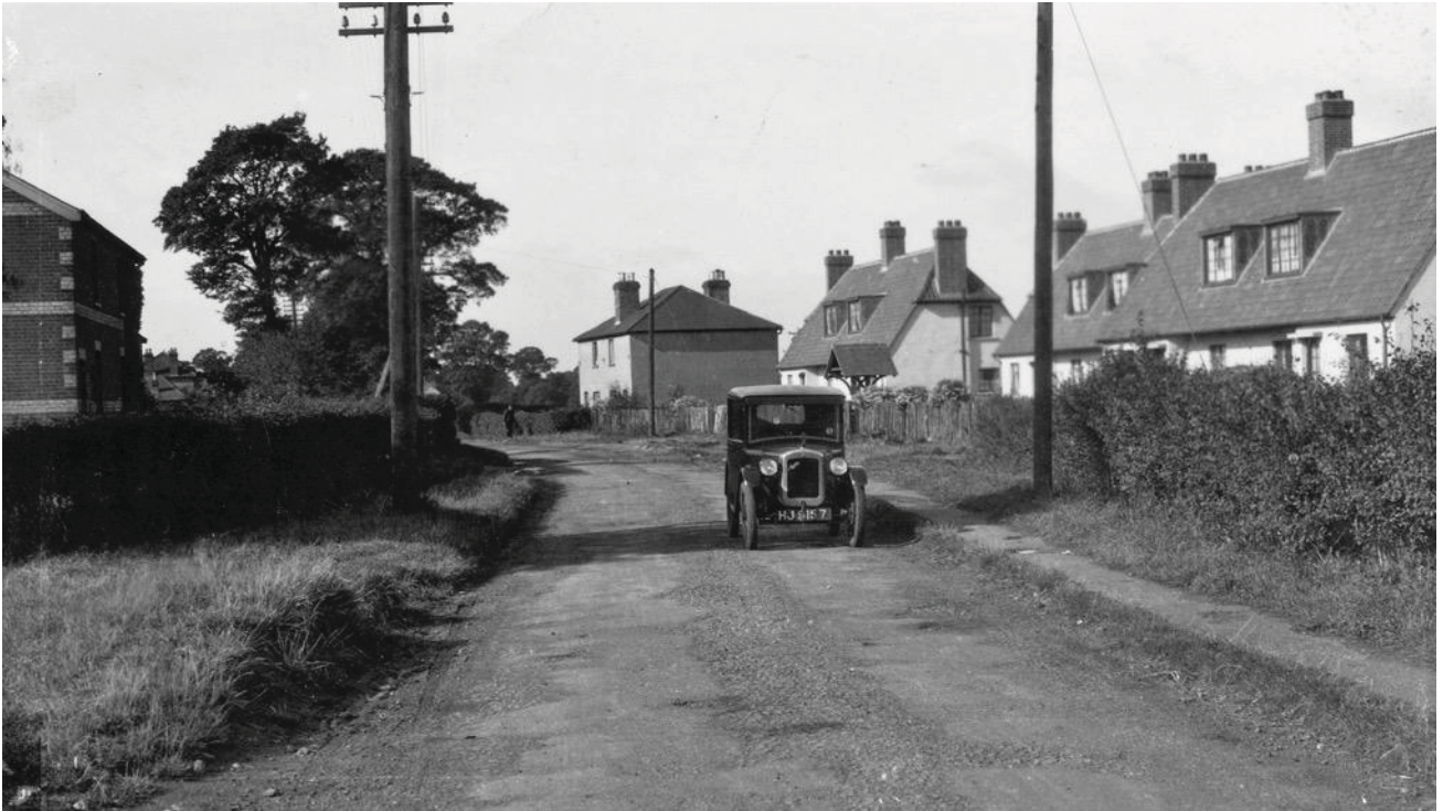
Church Road looking towards the church 1920's - 1930's