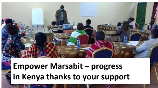
Empower Marsabit – progress in Kenya thanks to your support

One tap mobile: +443300885830,,86165140198#,,, *748883# The United Kingdom